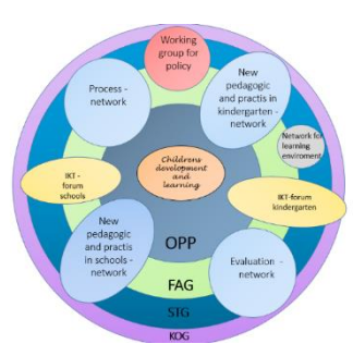
Different network - groups

innovate new pedagogical practice to head processes co – creating pictures of the future and goal processes the vision together.